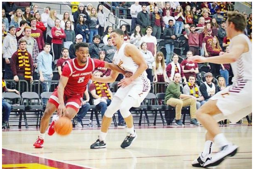
Saint Joseph's versus Loyola Chicago