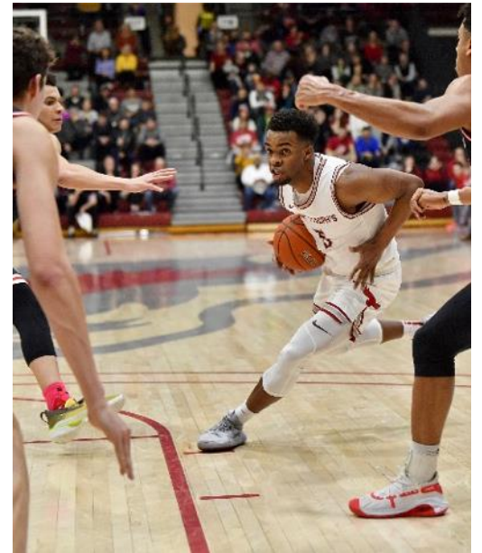
Saint Joseph's versus Davidson